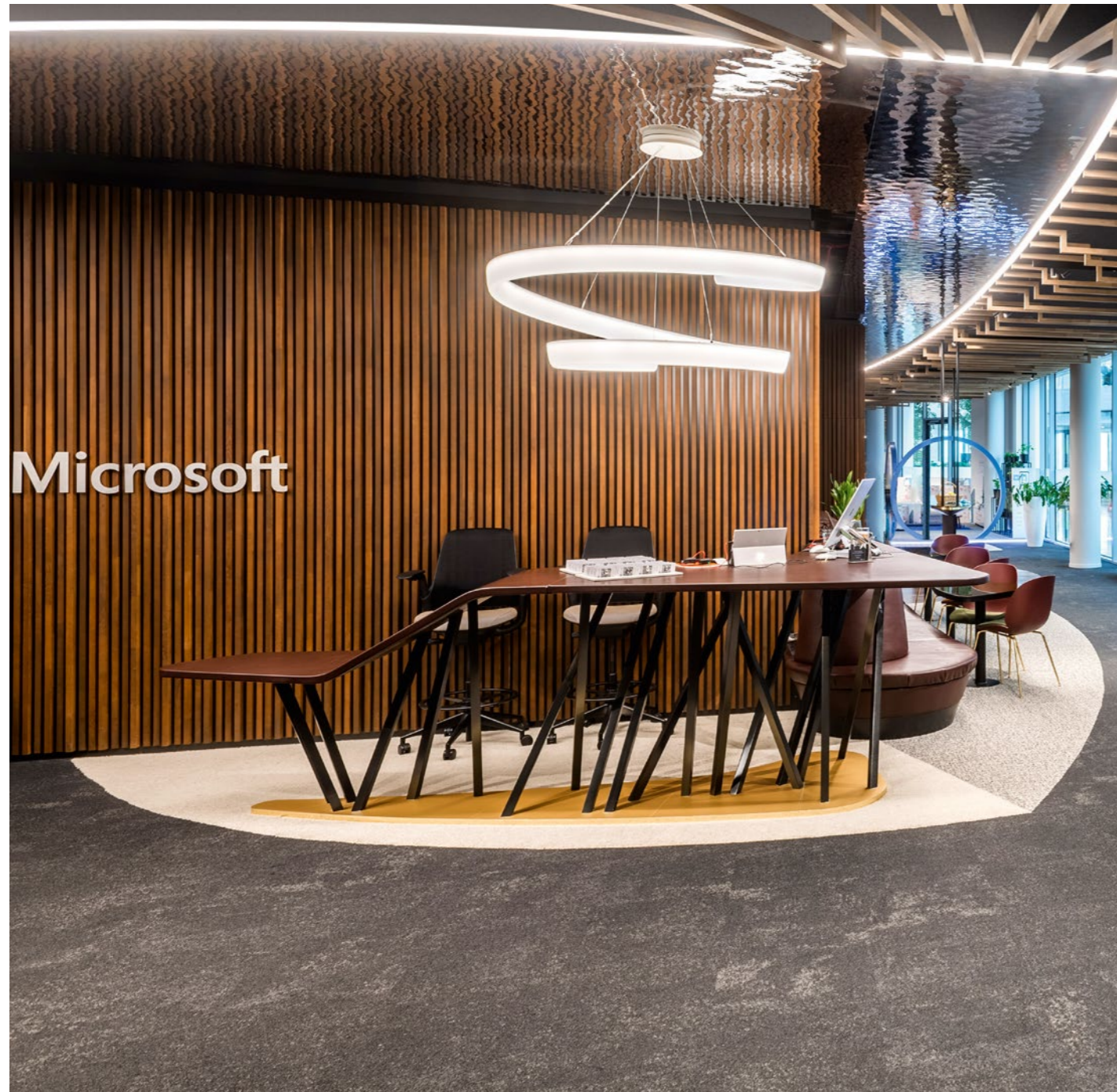
OFFICE | MICROSOFT | CONCEPT & DESIGN: PROCOS GROUP BRUSSELS | BELGIUM