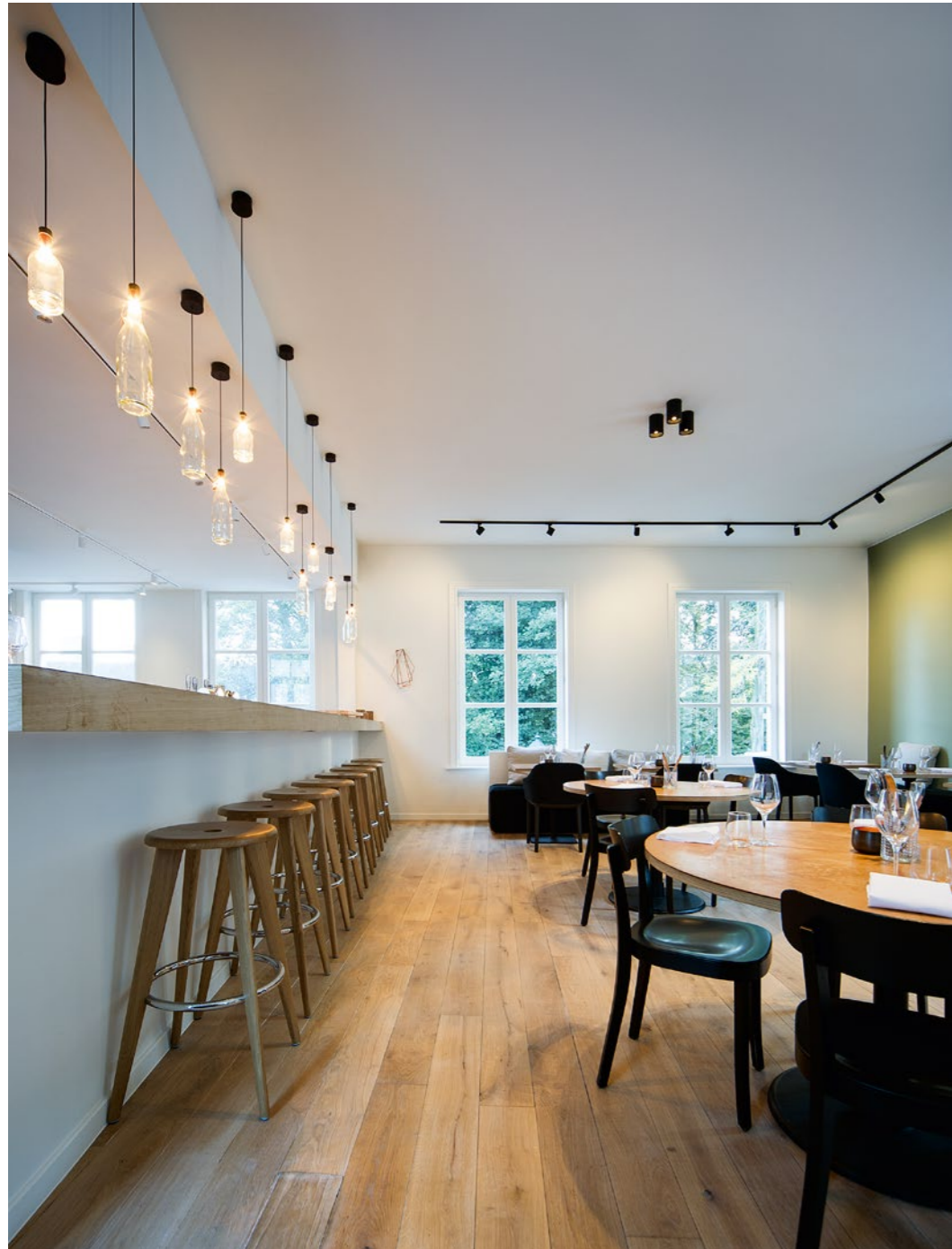
RESTAURANT GUST | INTERIOR DESIGN FREDERIC HOOFT KORTRIJK | BELGIUM